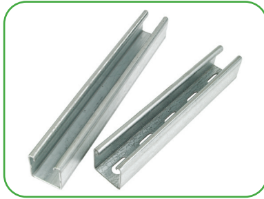
Atkore Unistrut Channel